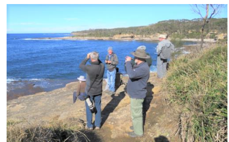
Social distancing at Wasp Head

Only two non-avian species were reported, Swamp Wallabies and an Eastern Grey Kangaroo. No whales or seals were recorded.