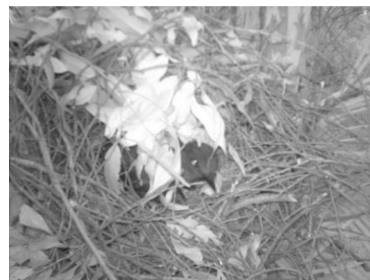
Lyrebird leaving nest

2. We catch her coming off the nest in the morning, often, between 6.30 and 7.00, as she slowly comes out of the hole before taking off. But we have only once caught some blurred tail feathers as she leaves the nest. We rarely see her leaving the nest during the day. So, coming and going is an extremely fast business.