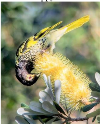
Regent Honeyeater