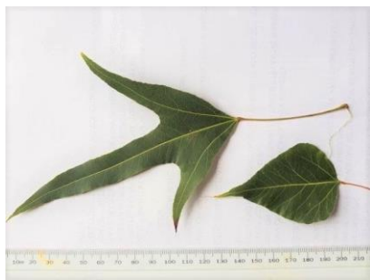
Juvenile (left) and adult (right) leaves.

Brachychiton populneus is widespread from rainforests to dry inland areas in Victoria, NSW, Queensland and the Northern Territory. It was introduced to Western Australia, where it is now considered an environmental weed. The trunk is wide at the base and tapers toward the top. The bark is green and smooth on young trees and branches, becoming darker grey with a granular texture and shallow vertical fissures in mature species. Adult leaves are 5-10cm long and 2-5cm wide, ovate to lanceolate, drawn out into a fine point, on slender petioles (stalks). Juvenile leaves generally have 3 pointed lobes. The upper leaf surface is a bright, glossy green, while the underside is paler and less shiny. Flowers are cream to white with reddish spots and are bell shaped, due to the partially joined 5 sepals which are 10-15mm long. Petals are absent. Separate male and female flowers are found on the same plant and the flowering period is from Oct. to Dec. The seed pod is a woody follicle, splitting along the top and resembling a boat. Seeds are yellowish and about 7mm long. Each is covered with short, prickly, fiberglass-like hairs which can cause skin and eye irritations.