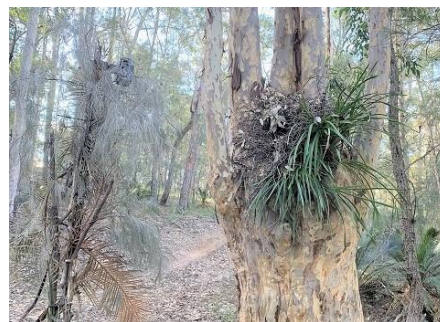
Lyrebird nest and camera

We found the nest on 16 June 2020. It is about 3m high, in the fork of a spotted gum, supported by the tree and an orchid, probably Cymbidium suave . When we initially inspected it, we didn't think it was finished, as there was very little lining inside, and no egg. But we put a camera up the same day to see what was going on.