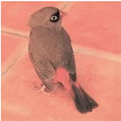
Beautiful Firetail

Having sighted this Beautiful Firetail, as thrilling as that was, it now needed some care. Often after a strike, birds will go into shock and shut down. If kept quiet and secluded, they will regain consciousness in a short period and are able to be released. It’s difficult to tell if this impact was a direct or glancing strike as this obviously affects the force of the strike. The Firetail regained consciousness late in the afternoon, but it was too dark for release. The next morning, we tried but it was apparent that there was a wing injury as flying was difficult. Food and water were now essential. A collection of seeded grasses was presented, and the Firetail was observed feeding. It was looking like it would be touch and go but on checking Monday morning, sadly it had died overnight.