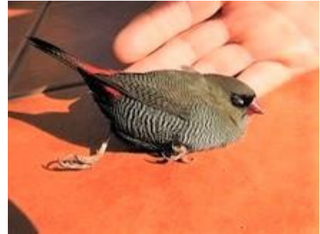
Beautiful Firetail