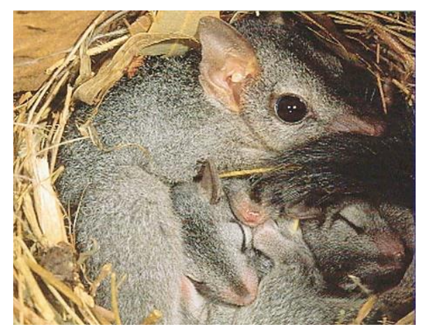
Phascogale with young

There are several subspecies of the brush-tailed phascogale in Australia (WA southwest, the Kimberley,