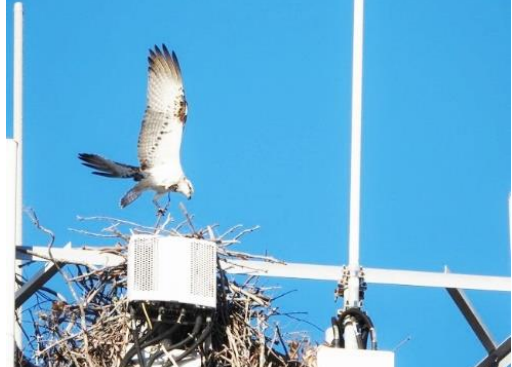
Osprey nest building

structural challenges of the tower and were observed on most days throughout June adding sticks to the nest. Placement was quite deliberate and Geoff observed a bird place a stick and then take off with it, returning to place it in another spot. We assume they had learned from their past experience at this site.