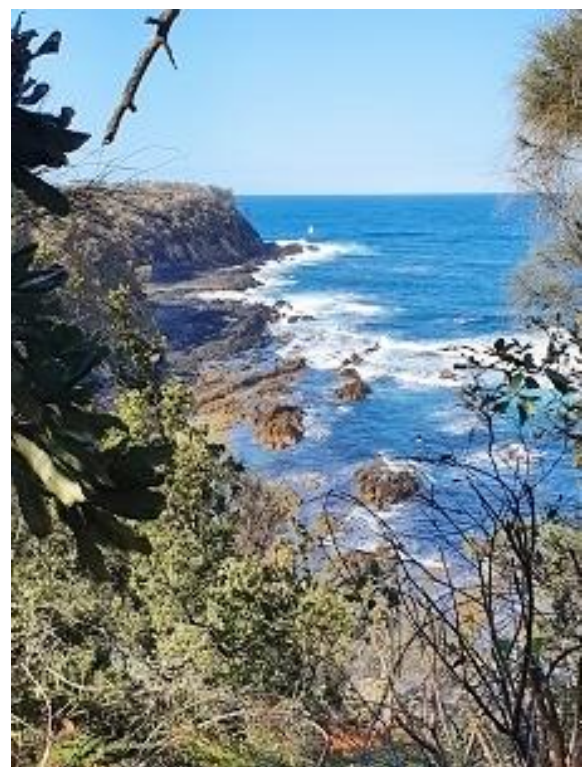
View towards Long Nose Point

We then turned towards Long Nose Point, a headland just south of Burrewarra Point, and a great spot for seawatching. The strong cold winds discouraged some from walking out to the point itself, and those of us who did, kept our stay short. We had distant views of Albatross and a whale spout, and closer views of Australian Gannet and a raft of around 200 Silver Gull, 40 Crested Tern and 6 White-fronted Tern. From there we walked through a