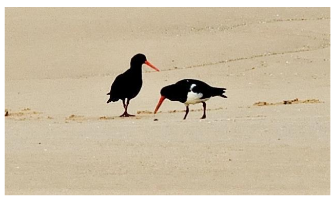
Pied and Sooty Oystercatcher feeding together

Recently I witnessed an interesting interaction between two birds that kept me entertained for nearly 15 minutes. A Pied Oystercatcher had managed to dig up and eat at least 20 pipis when a Sooty Oystercatcher joined in and they continued to work their way through a few more; though it didn't appear that the Sooty Oystercatcher had very much success. The Pied Oystercatcher didn't react to the intrusion and continued close contact with the Sooty Oystercatcher. Finally, the Sooty Oystercatcher got bored and flew off leaving the Pied Oystercatcher to continue working over the area.