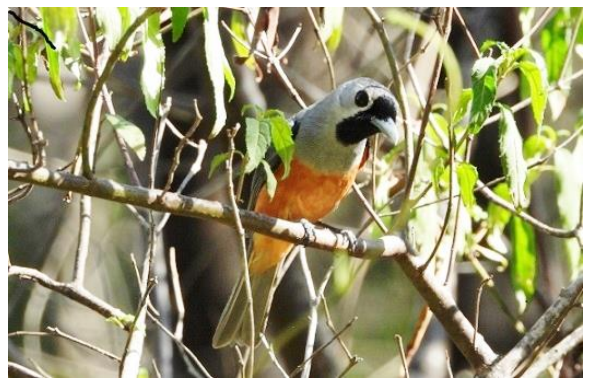
Black Faced Monarch

There are a few birds in the Eurobodalla Regional Botanic Gardens (ERBG) that are hard to photograph for one or more reasons: they may be scarce, shy and/or moving quickly either high in the trees or low in bushes. These birds include the Rufous Fantail, Eastern Whipbird, Golden Whistler, Bassian Thrush, the Glossy Black-Cockatoo, the Superb Lyrebird and the Black-faced Monarch. The Gardens are richer for the presence of these birds. The downside is that people like me are attracted to the Gardens.