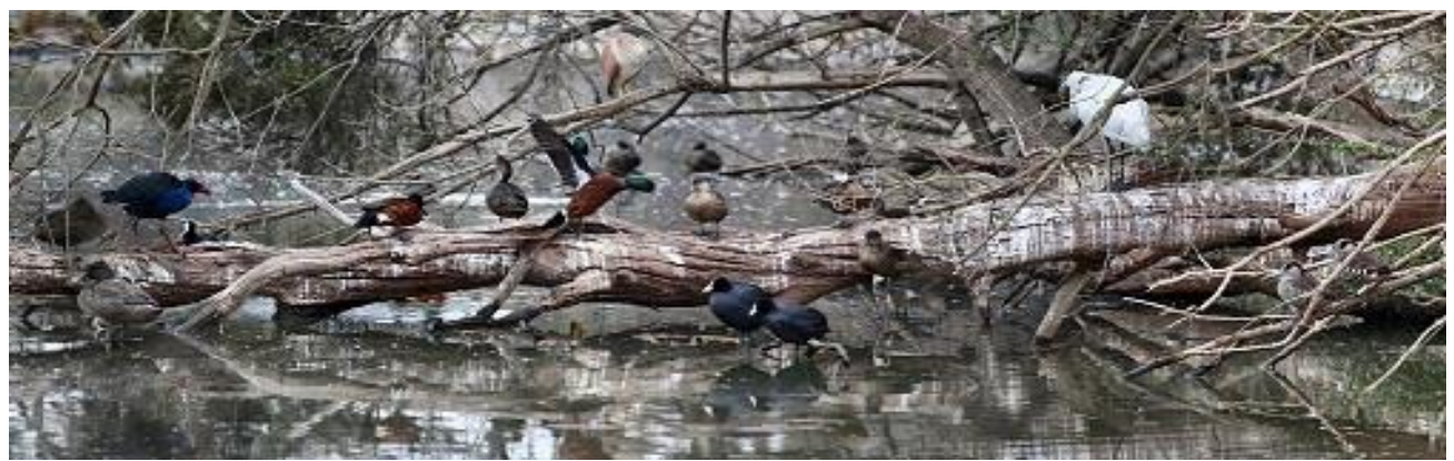
Birds at Glebe Park

Crossing the road to the pond in Glebe Park, we were delighted to find more Zebra Ducks, as well as about 30 Freckled Ducks, a Nankeen Night Heron, a single Royal Spoonbill, Chestnut Teasl and Pacific Black Ducks. In the bushes nearby were 4 Olive-backed Orioles, Eastern Whipbirds, Silvereyes and Black-faced Cuckooshrikes, along with thornbills, fairly-wrens and the usual black and white species. An almost endless stream of more than 120 Pied Currawongs gradually passed overhead.