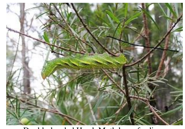
Double-headed Hawk Moth larva feeding on Geebung.